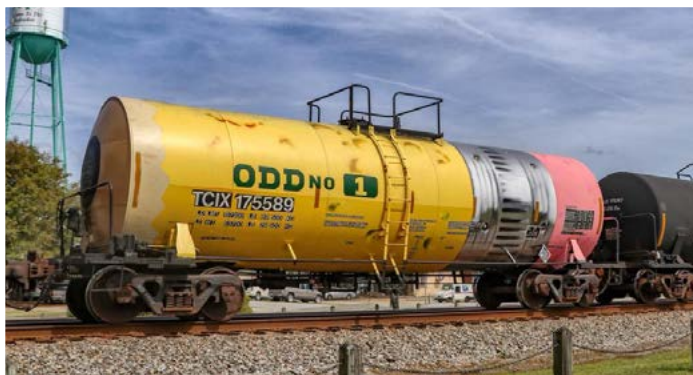
Looks like an interesting paint scheme to replicate!