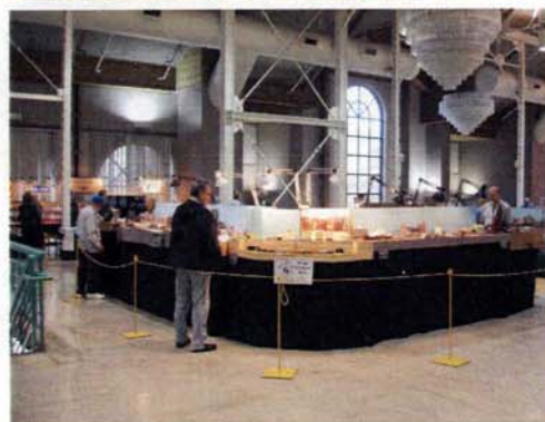
Above: November 2011 NMRA Show at the Utah State Fair park.