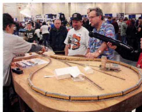
Below: Worlds Greatest Hobby Show February 2012